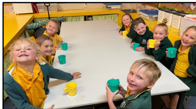
K/1 enjoyed a warm milo drink after their swimming lesson this morning.